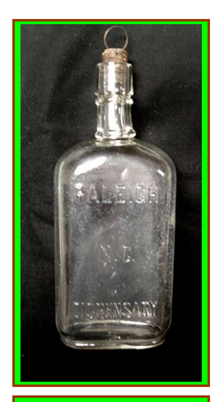
Whitt Stallings entered the competition for the best bottle under $50.00 with this nice RALEIGH, N.C. DISPENSARY.