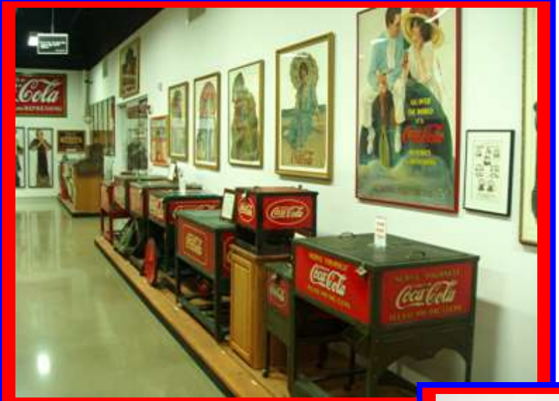
Ice Cold Coke Hit the Market with these early Ice Box Coolers.