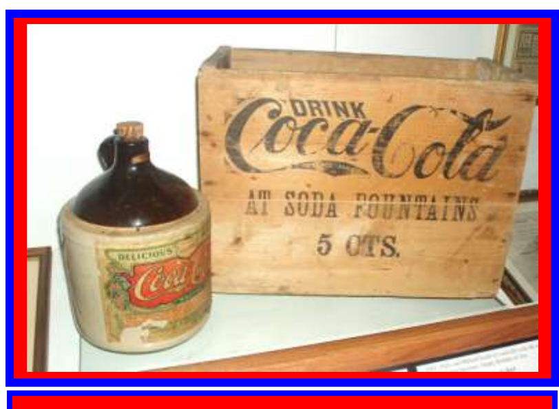
Early Coca-Cola Fountain Syrup Jugs