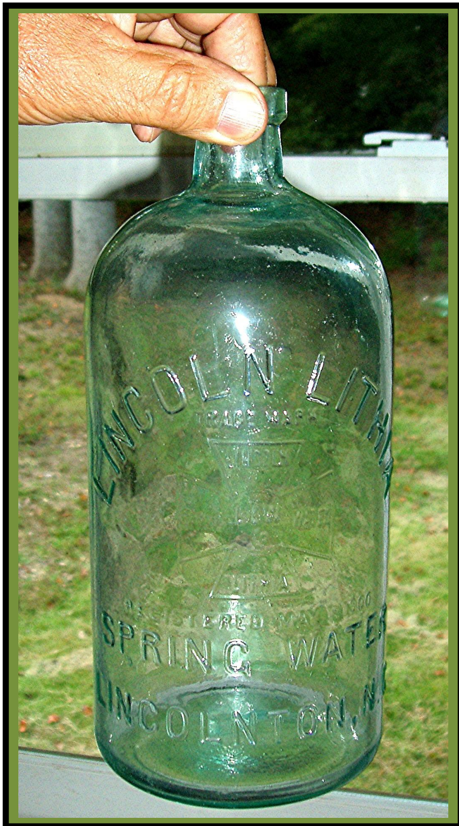
Whit Stallings presented this nice LINCOLN LITHIA SPRING WATER from LINCOLNTON, N.C.