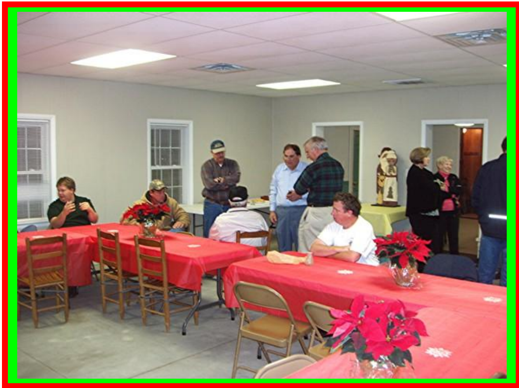
Good old boys talking bottles