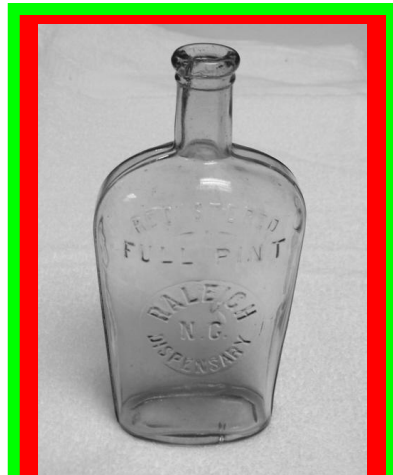
Whit Stallings' Raleigh Dispensary Flask Best Bottle Under $50.00