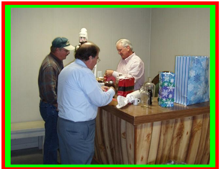
Relaxing after a good meal, waiting for a chance to buy raffle tickets