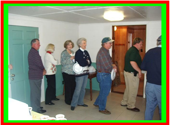
Waiting for a turn at the Christmas Buffet