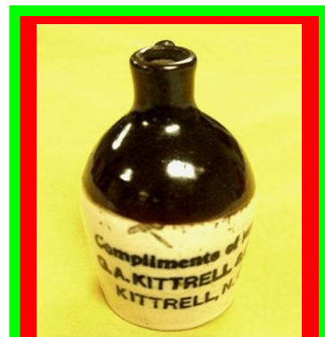
Pem Woodlief's Mini Jug Best Bottle Over $50.00