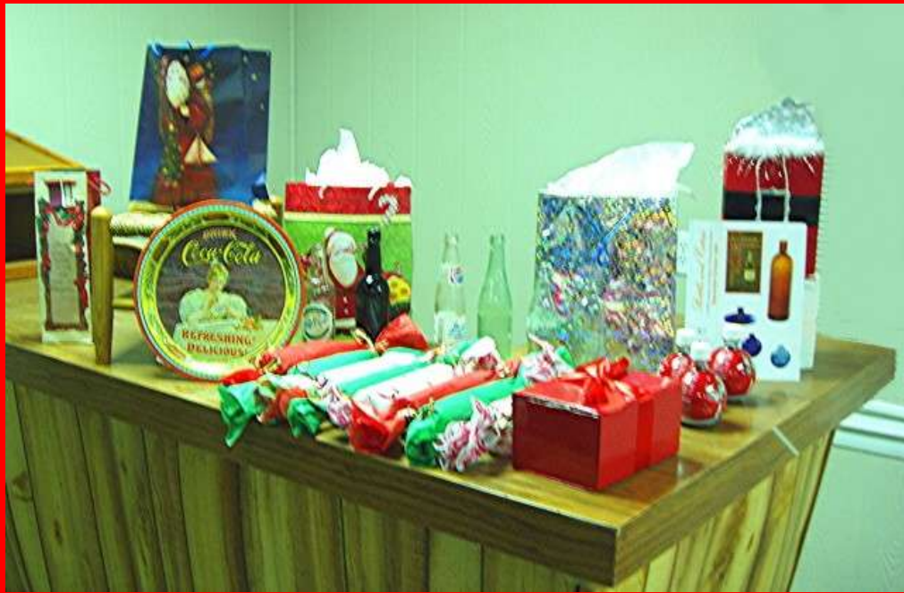
The raffle had lots of nice bottles and other beautiful surprises.