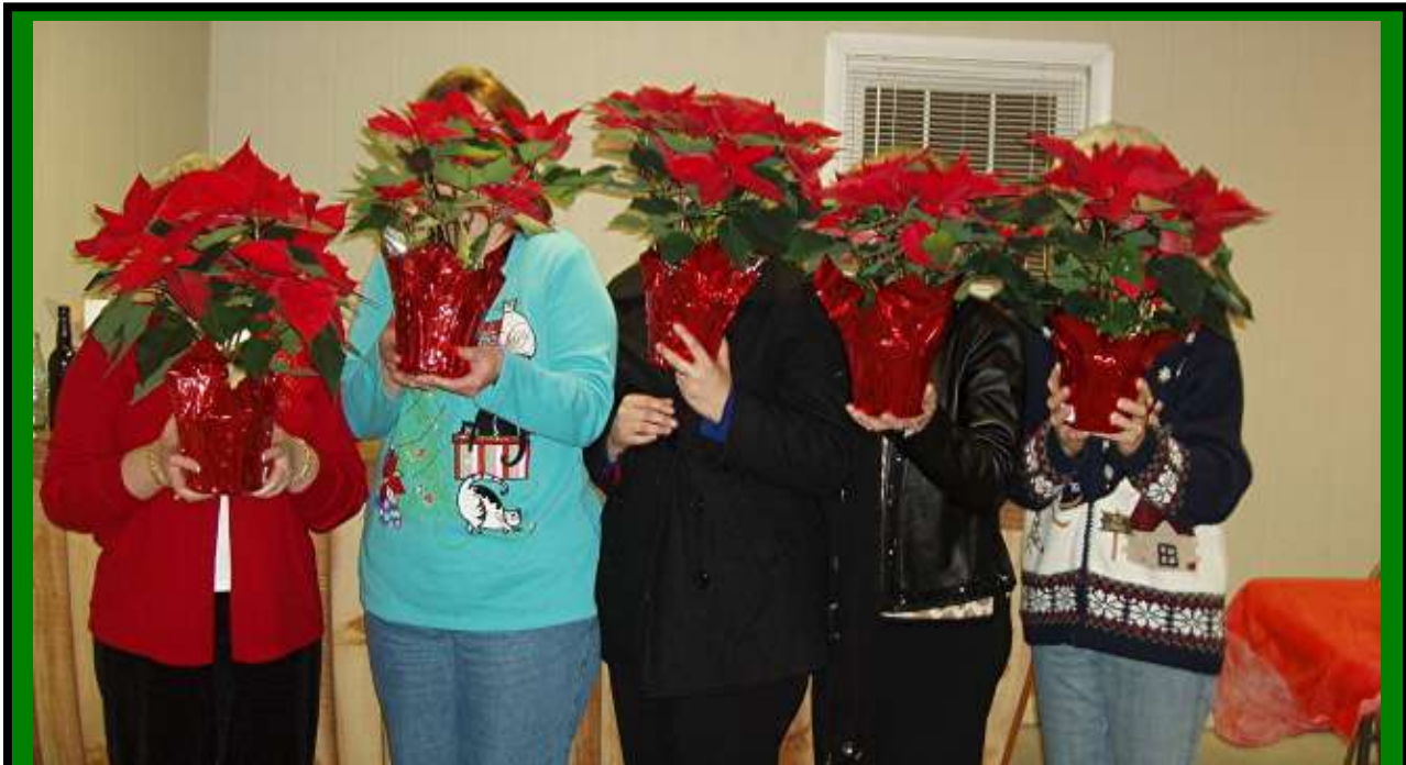
Who are those lucky ladies who won the beautiful Poinsettias?