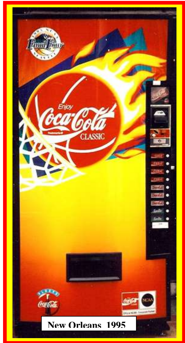
New Orleans 1995