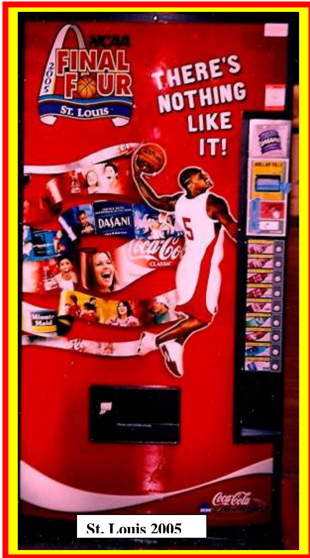
St. Louis 2005